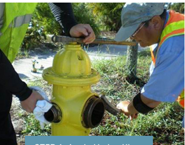
STEP 1: Apply Hydra-Kleen, then clean threads.