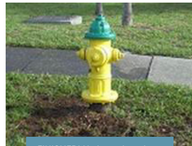
FINISHED! Hydrant threads are fully cleaned and lubricated.